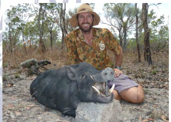
Another one down - 27 4/8 DS.