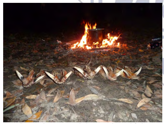
Doesn't get much better than this!

All in all we grassed over 30 boars, with a dozen of these going over 27 points. A great trip made even better