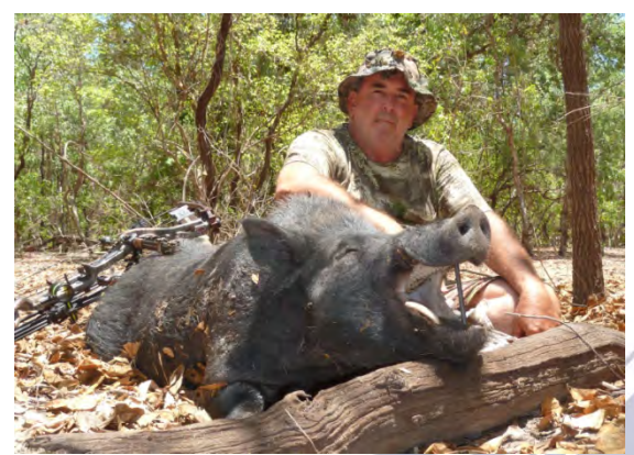
Mono with a 28 4/8 DS boar.

kilometres walked along the dry creek beds.