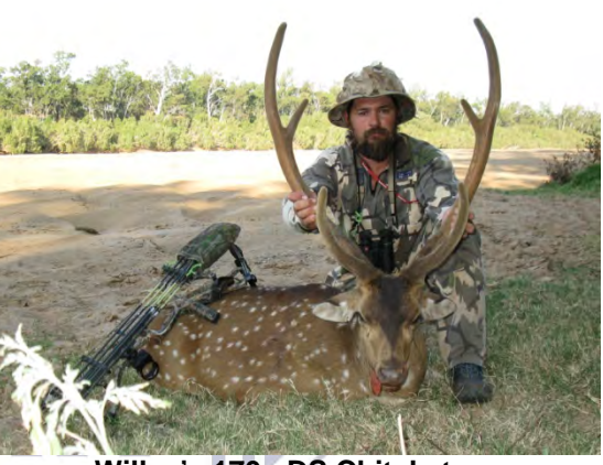
Willsy's 170+ DS Chital stag.