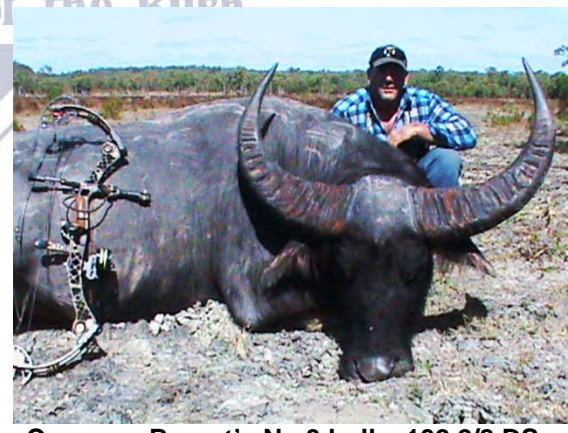
Cameron Bryant's No.3 bull - 102 2/8 DS.